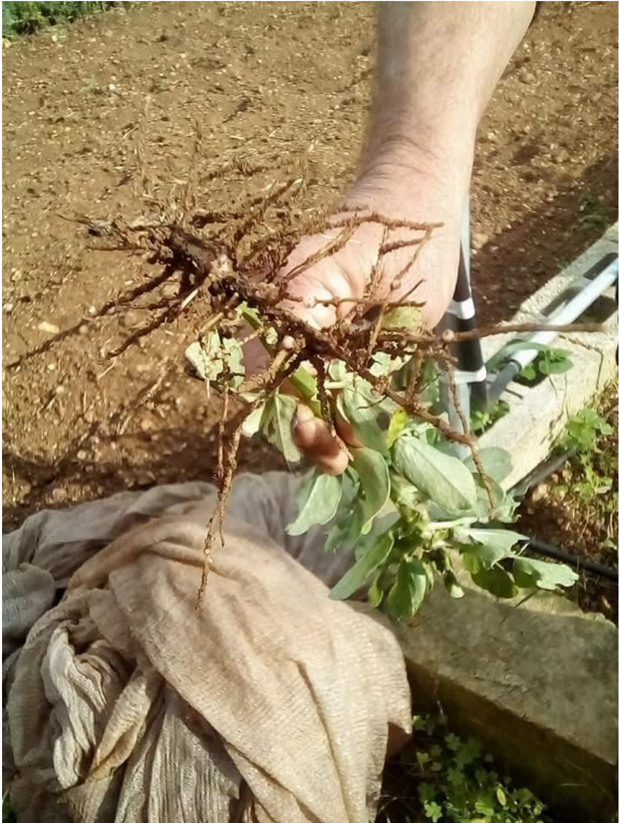
Jayelle Galea Senior 1 – Organic farmer showing how to plant crops.